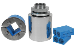
SLA R kit

For detailed information, please visit roxtec.com .